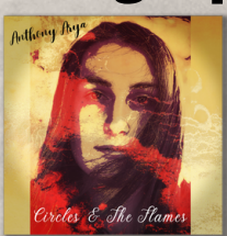
Circles & the Flames